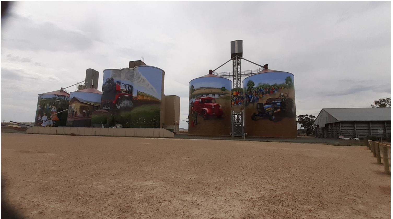
Above:- Silo art at Colbinabbin.