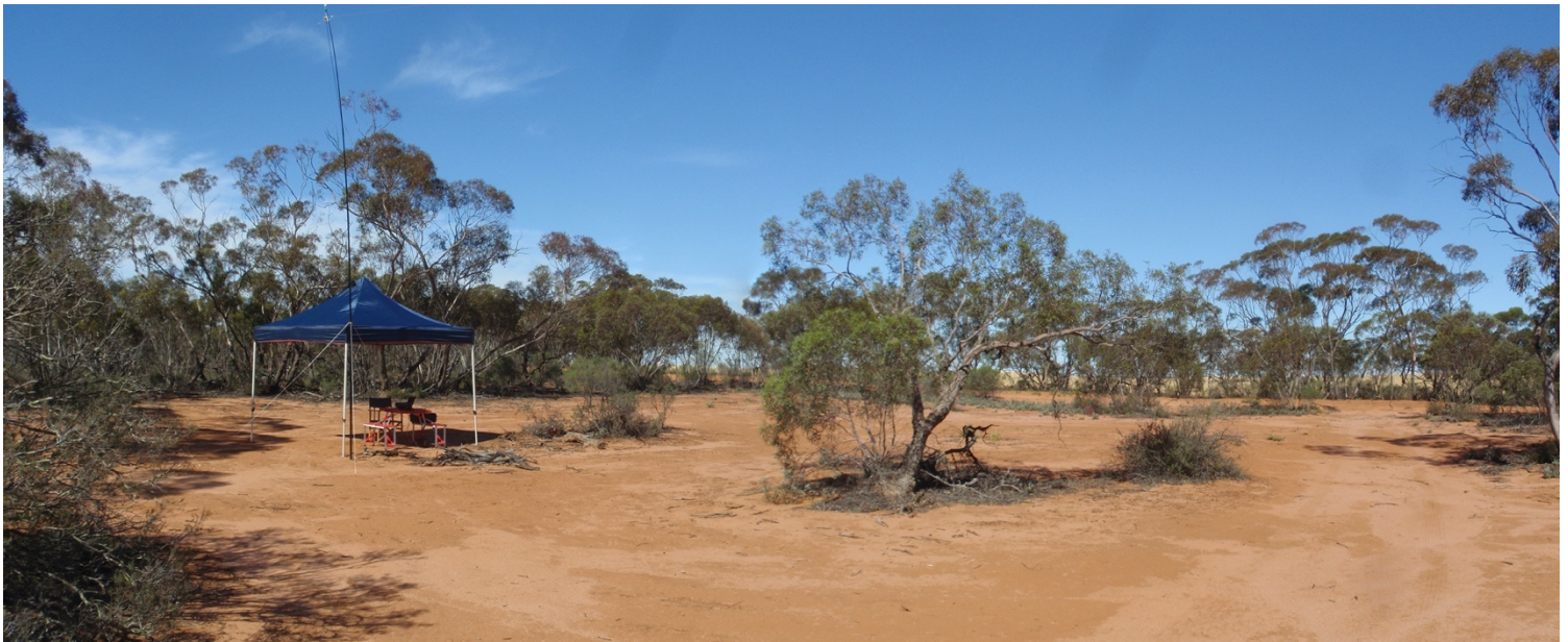
Above:- Malcolm VK3OAK at the Annuello Flora & Fauna Reserve.