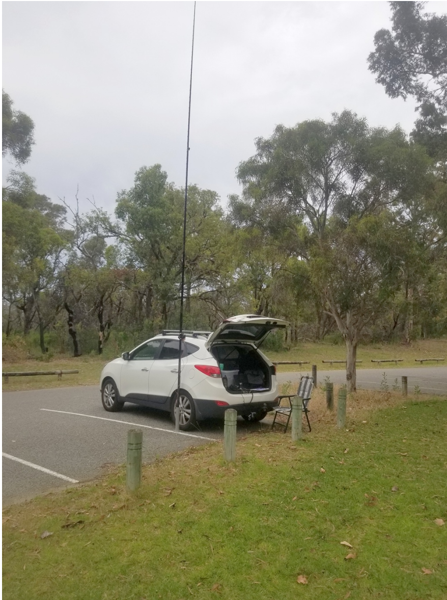
Above:- The set-up of Hans VK6XN at the Kings Park Botanic Garden.

"Four countries worked.....Conditions were far better than Saturday. 20m and 40m both active and nearly all contacts were on ssb. This yielded quite a few P2P.....A good result on both days by VK6 standards. A pleasant change to see more 'frequency agility' by activators".