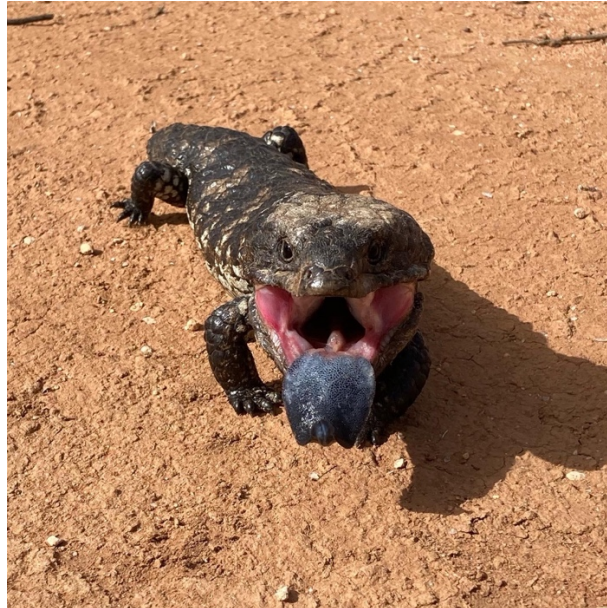
Above:- Bluey.

"It had cooled a bit by the time I got here. Down to high 30's. Instead of flies I was nearly carried away by small ants. Changing chairs sorted them out though. Set up at a bench in the empty camping area. Very pleasant after the heat of the morning.'