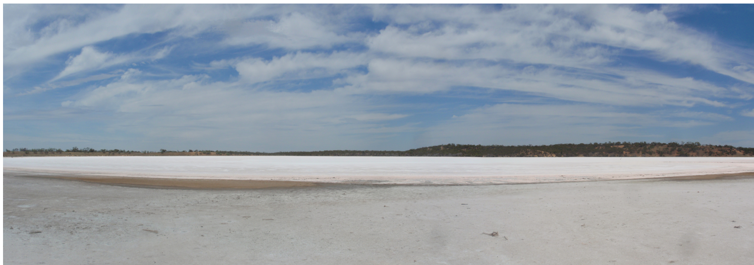
Above:- Salt lake at the Murray Sunset National Park.