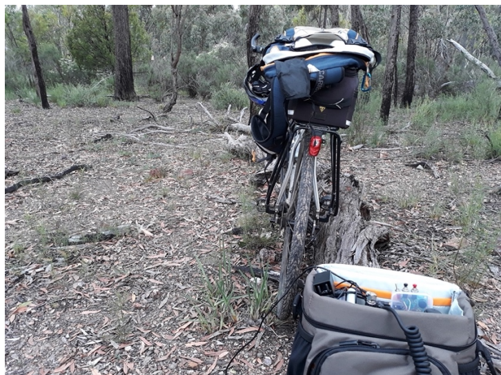
Above:- Chris VK1CT's operating location from Gossan Hill.