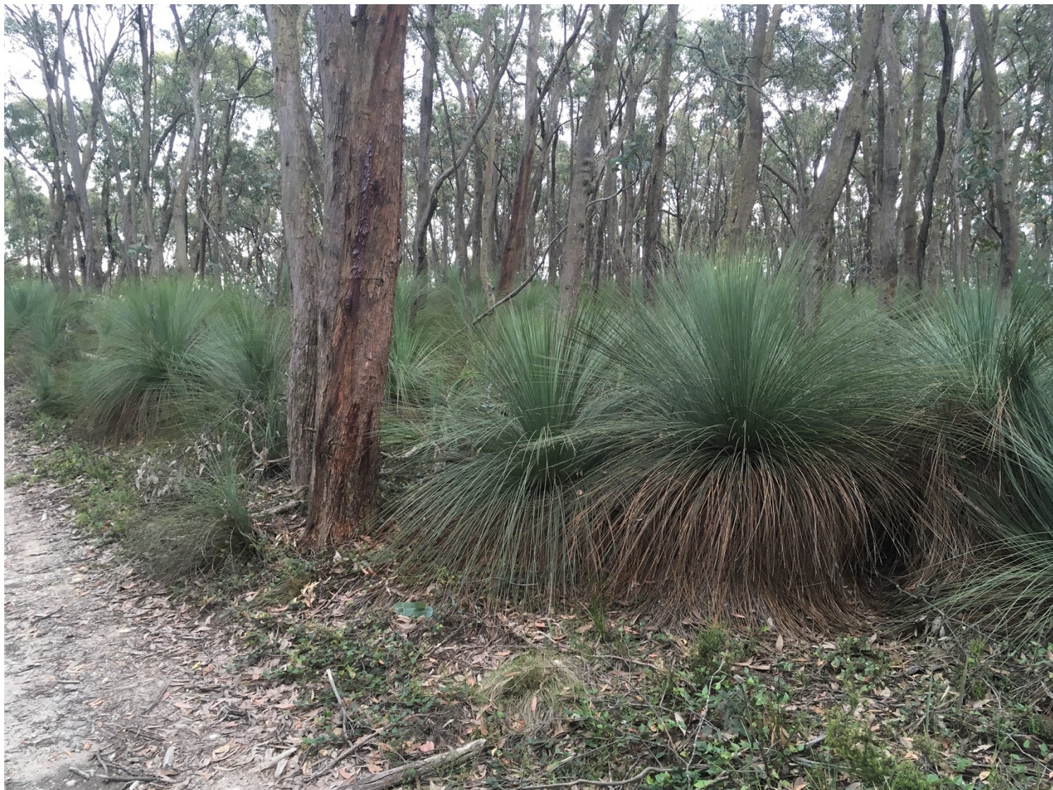
Above:- Lerderderg State Park.