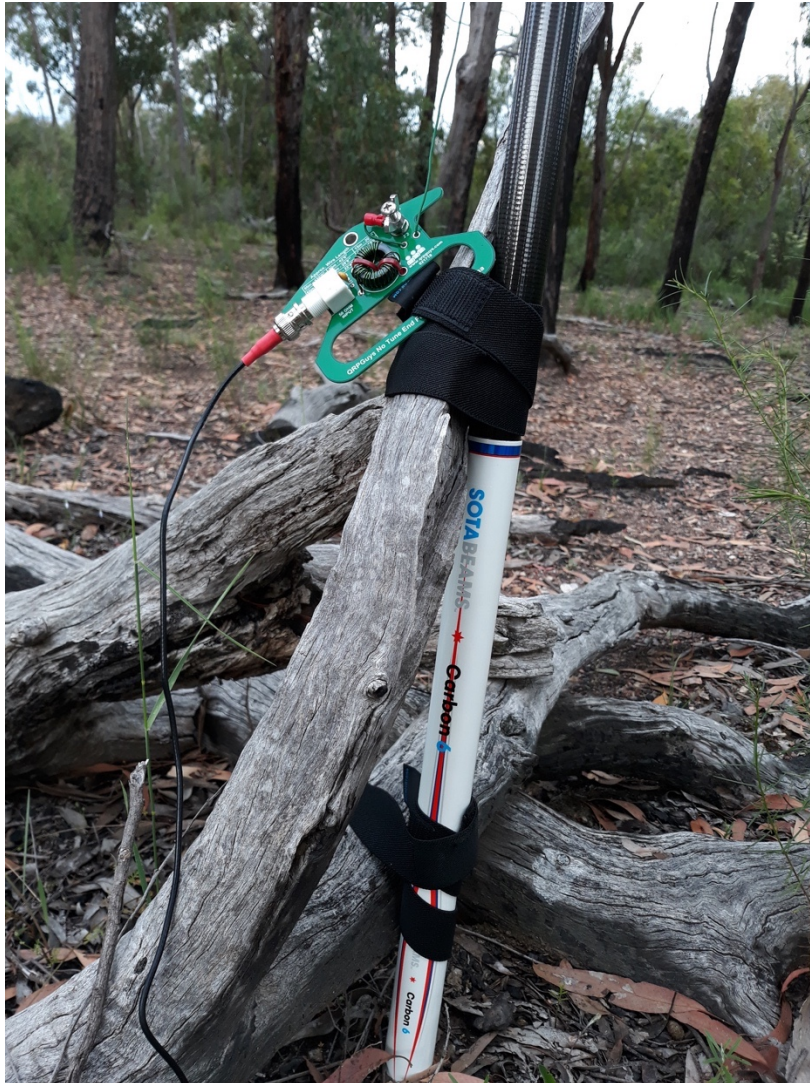
Above:- Antenna at Gossan Hill.