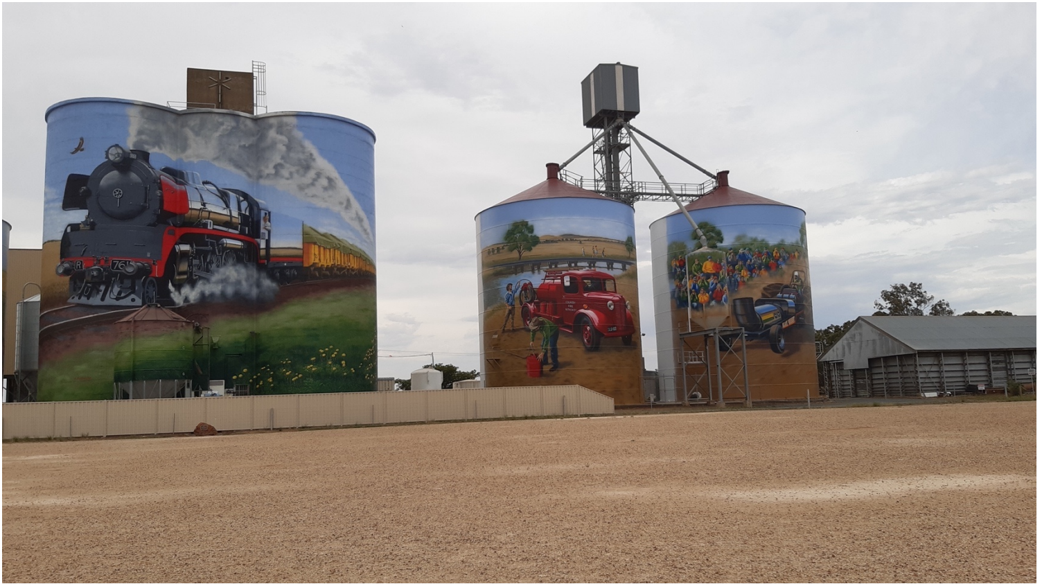
Above:- Silo art at Colbinabbin.