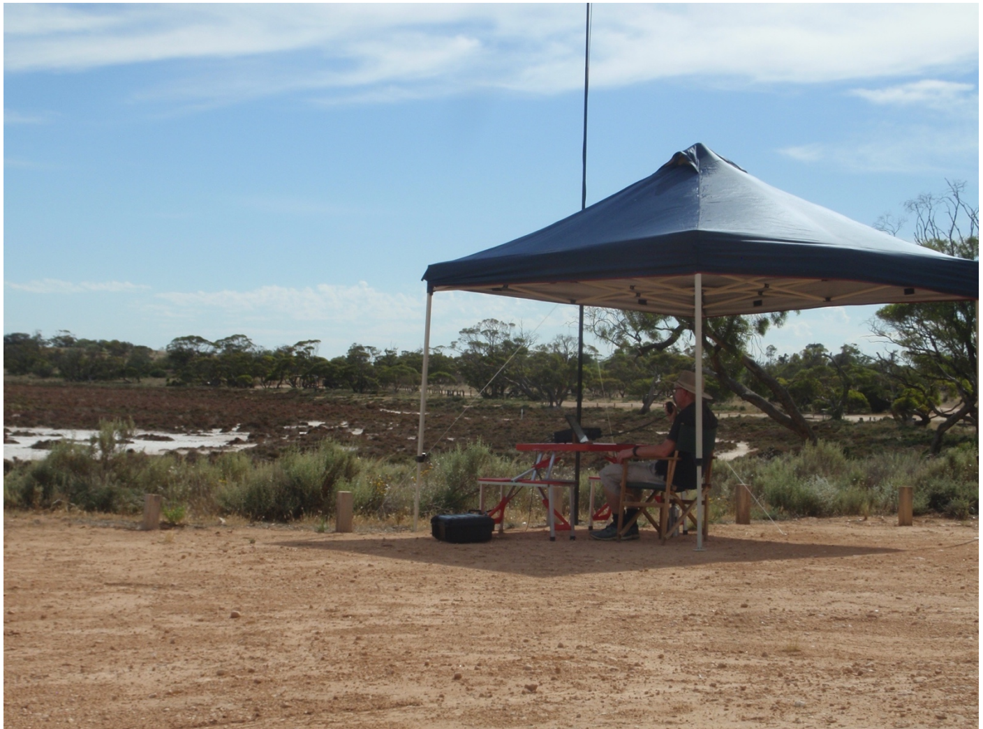
Above:- Malcolm VK3OAK at the Murray Sunset National Park.