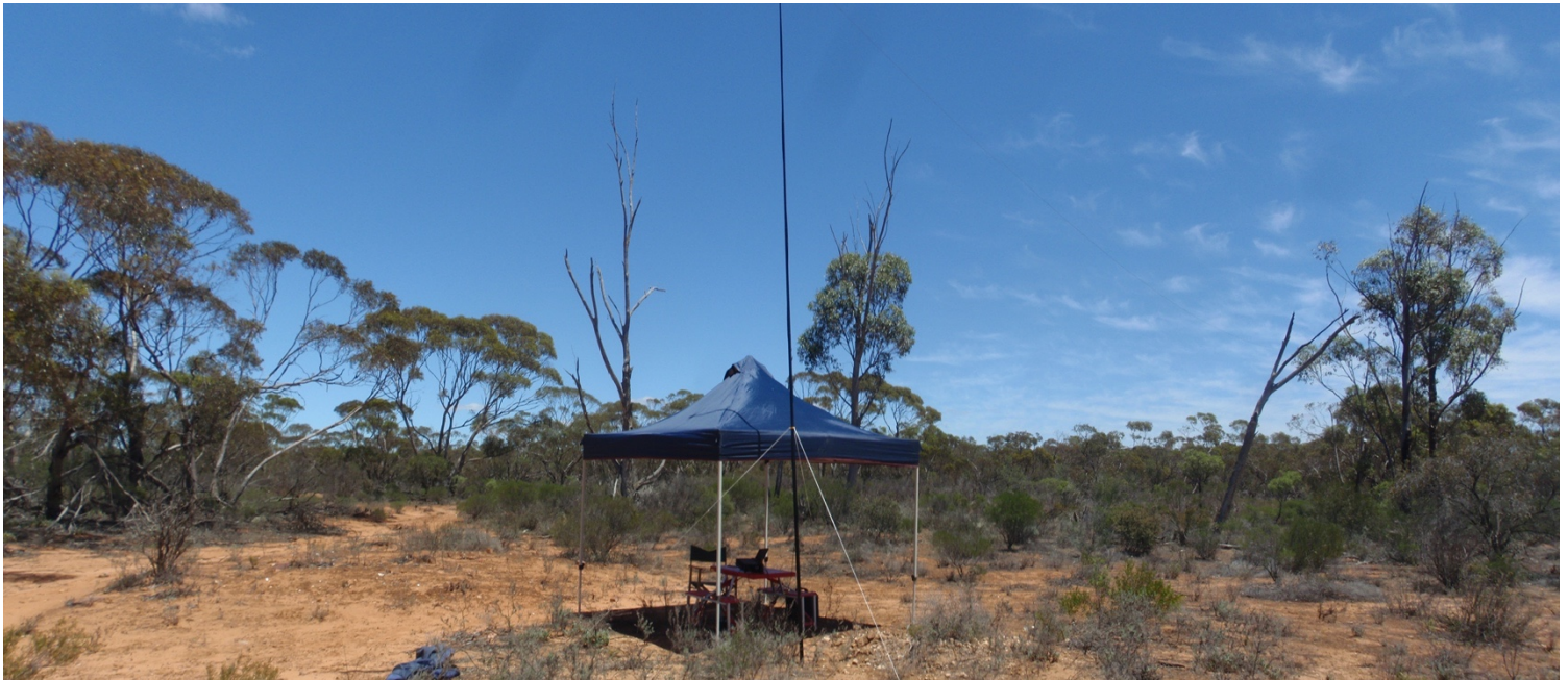
Above:- Malcolm VK3OAK at the Kulwin Flora & Fauna Reserve.